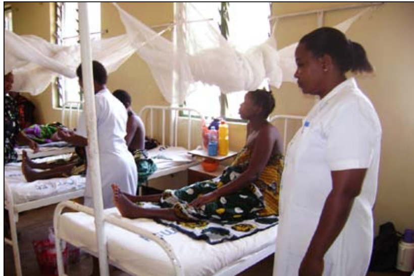
Nurses and patients at the Kisarawe clinic

included a review of equipment and supplies available for antenatal care, labor and birth, postnatal care, and newborn care. Information was also gathered on providers' training, performance, and confidence in performing a variety of skills. The final part of the assessment utilized community focus group discussions (FGD) in order to understand community perspectives on issues that affect access to quality maternal and newborn care.