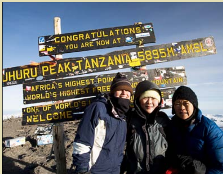
Challenge participants at the summit of Mt. Kilimanjaro

The Kis-Kili Challenge was a success on every front. Our team of international health workers and volunteers trained local health