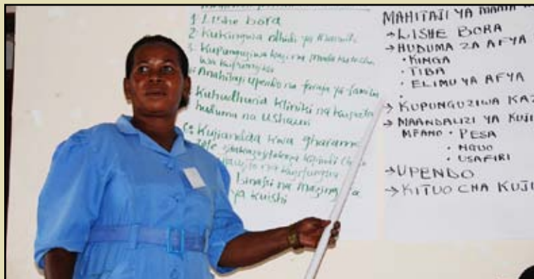
Nurse working in Kisarawe District presenting at the conference on the health needs of women during pregnancy