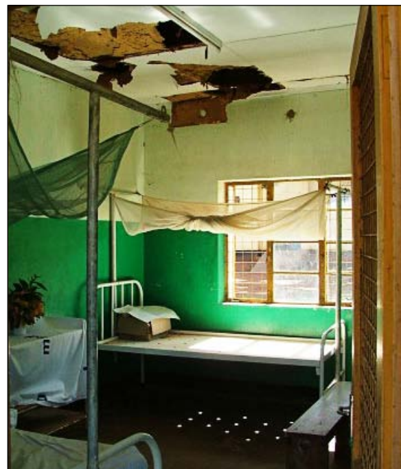
Maternity wing, Kisarawe Hospital

"What is to be done to rectify the above problems?" Common responses included access to reliable transport, community education on reproductive health issues, and improved and regular training for service providers.