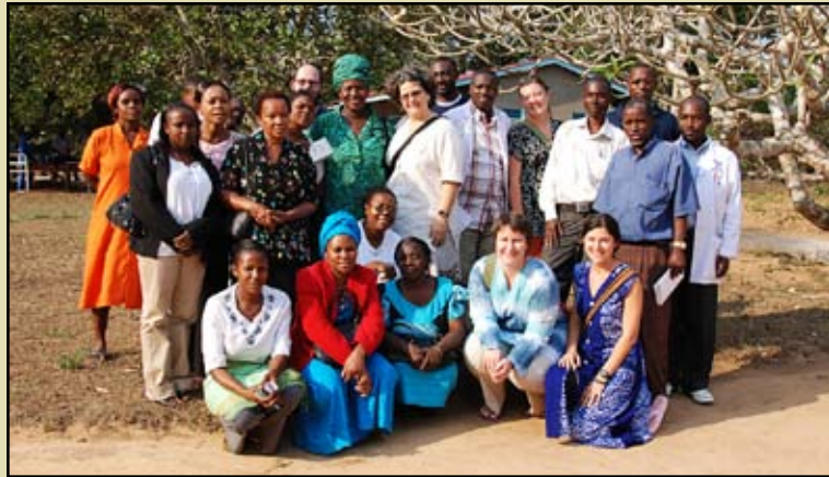
COHI staff and volunteers with FLEMAFA staff local, Kisarawe District Health Ministry staff and local health providers

As a result of both the Challenge and the ongoing Initiative, COHI and FLEMAFA have earned notice and support from both local health officials and the Tanzanian government.