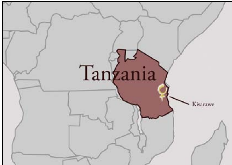
Location of Kisarawe, Tanzania